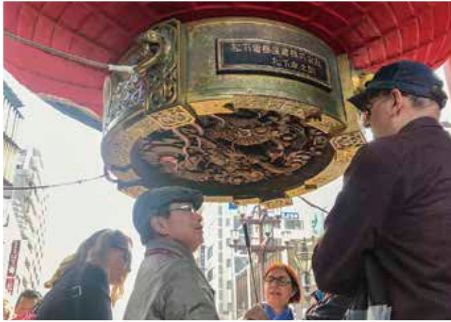
The huge lantern at Kaminarimon Gate in Sensoji Temple