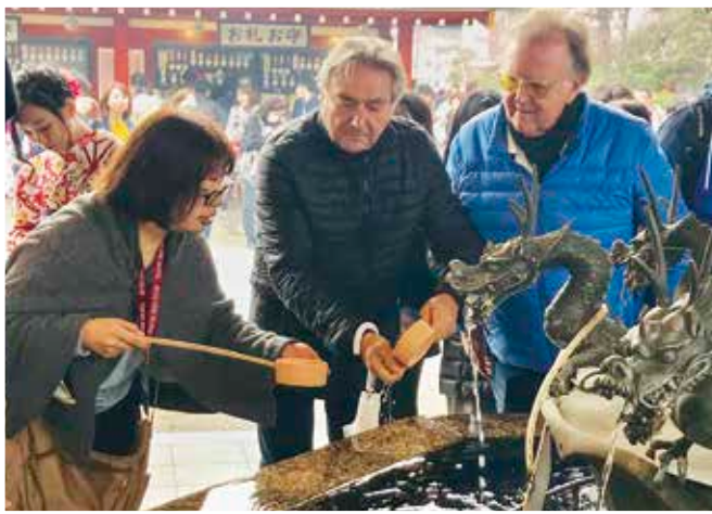
The water basin for purification in Sensoji Temple

Asakusa, one of the most traditional and lively neighborhoods in Tokyo, is waiting for your visit.