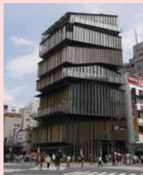
Asakusa Culture Tourist Information Center

To participate in a tour, please come to the TOKYO SGG CLUB counter on the first floor of Asakusa Culture Tourist Information Center, located across from the well-known Kaminarimon Gate of Sensoji Temple, as indicated on the map below. Please arrive 10 minutes before either scheduled starting time.